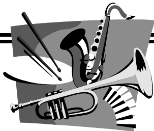
Ideas for a New Church

The Holiday Brass Concert planned for Saturday, December 19 th at Grace was cancelled due to the snowstorm. The event will be rescheduled for the spring.